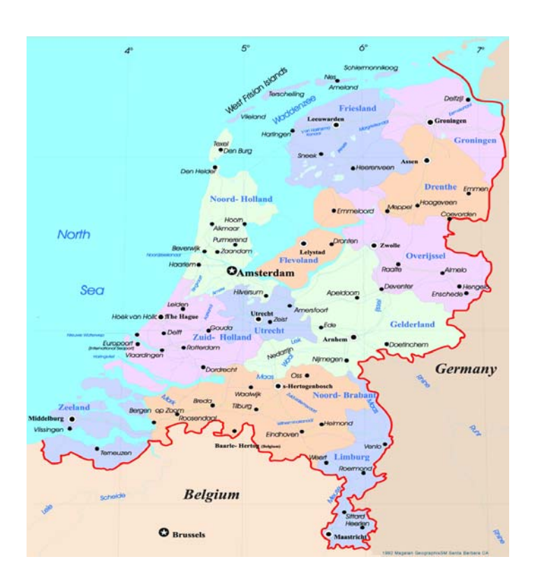
Figure 1: Map of the Netherlands

The Netherlands has a population of 16.4 million (January 2008), living in an area of approximately 41,526 \rm km^2 (33,900 \rm km^2 excluding rivers, lakes and canals). The population density is 483 people per \rm km^2 (2006). The greatest concentration of the population is in the west of the country. Of the 443 municipalities, 25 have a population of 100,000 or more (2007).